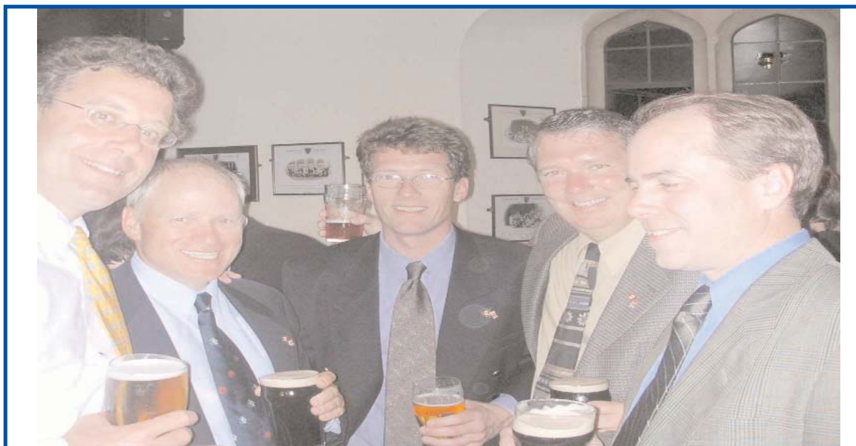
Part of the Canadian contingent holding court during the U.K. 75th anniversary tour at the Queen's Club, London.

A bi-annual newsletter of the Jesters Club (Ontario)